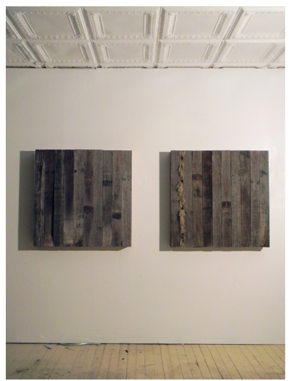
Alexander DiJulio, Icons , 2011, found wood, jute (dimensions variable)