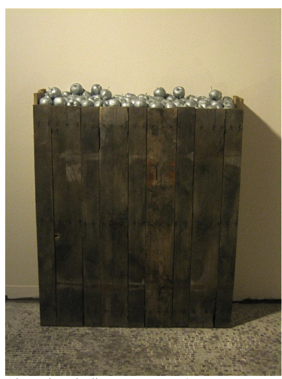
Alexander DiJulio, Reservation & Preservation , 2011, found wood, red delicious apples, chrome